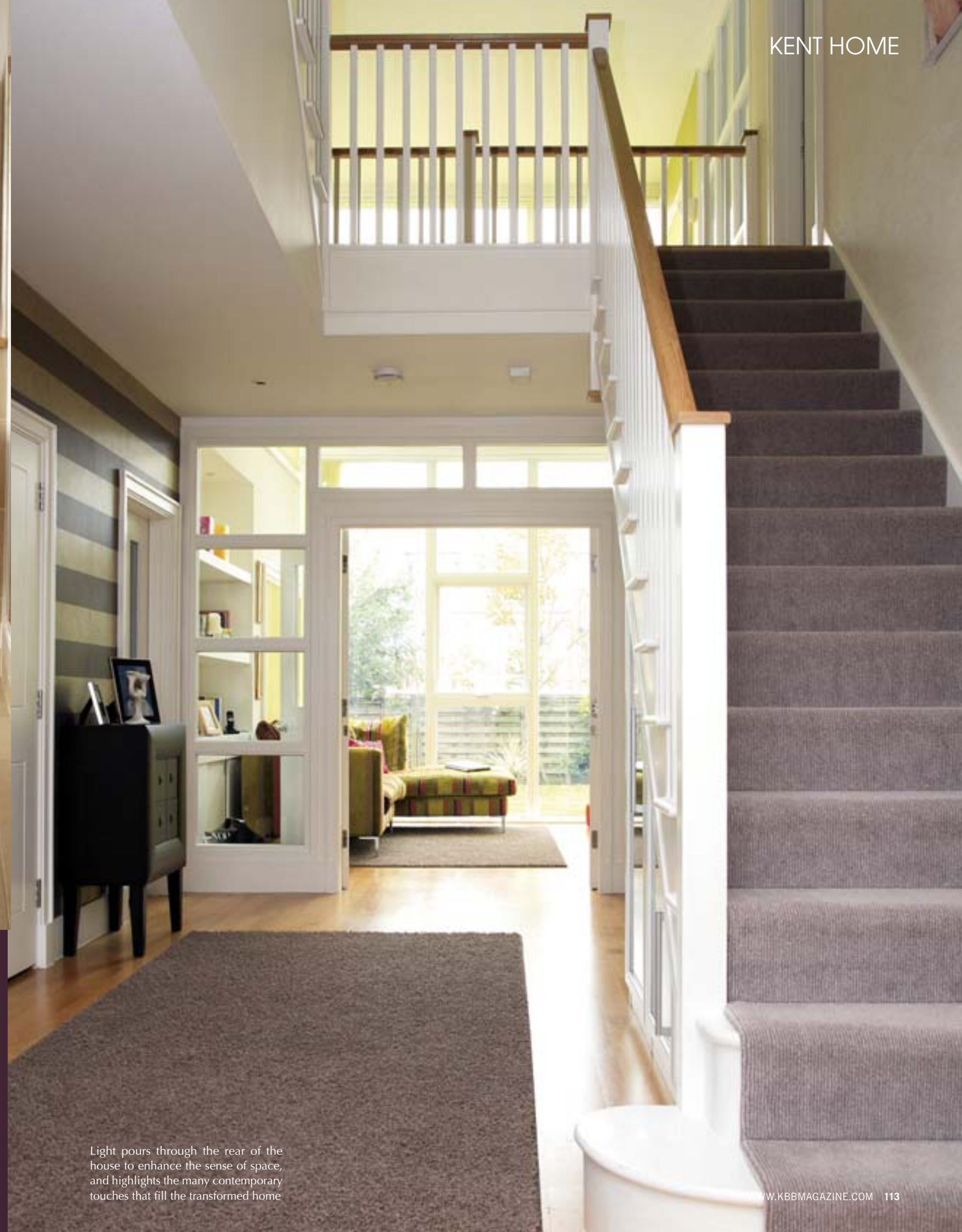
Light pours through the rear of the house to enhance the sense of space, and highlights the many contemporary touches that fill the transformed home

dining space links to a light-filled garden room. Inside, double-height glazing provides a peaceful viewpoint overlooking the garden, while a relaxing scheme of fresh green picks up the hues from the garden beyond. Lisa and Robin are thrilled with their newly revamped home. "The designers have fulfilled every request perfectly," Lisa concludes. "The house has become a light-filled, welcoming environment that allows the whole family to live stylishly and comfortably. It's just perfect for our lifestyle." [KBB]