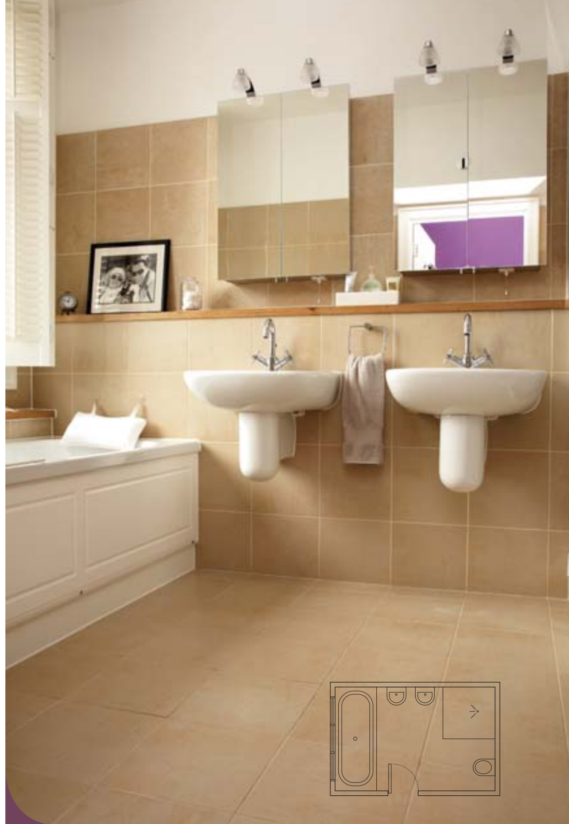
The ensuite features two basins, a spacious bath and walk-in shower adequately serving the couple's needs. White timber shutters offer a practical window dressing and privacy when required

A similar kitchen would cost around £25,000, a similar bathroom around £5000 and a similar bedroom around £15,000